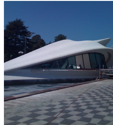
press - centre